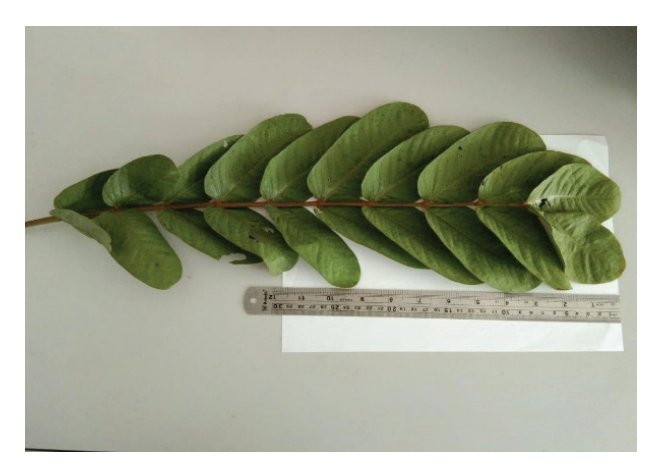
Figure 1. Cassia alata leaves collected from South Tangerang, Indonesia.

C. alata leaves were dried and ground using a blender to get a simplicia powder. The powder was macerated with 70% ethanol, with the ratio of 1:5 (ratio of simplicia powder and solvent) and stirred by a shaker at 110 rpm for 18 h. The extraction was repeated until the macerate color resembled the color of the solvent. Then, the extract was evaporated with a vacuum evaporator at 50 °C, yielding of the thick extract (Angelina et al. 2020).