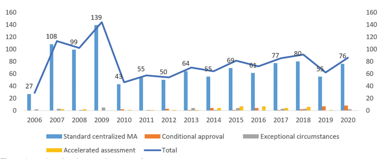
Figure 1. Number of marketing authorizations for 2006–2020.

and 2020. Three medicines have registered price in Bulgaria but are still not covered with public expenditures.