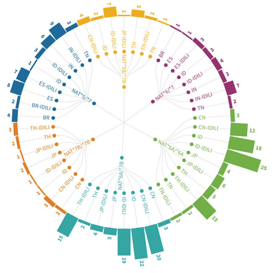
Figure 2. Frequency distribution of IDILI cases and controls of six NAT2 variants in various countries. Description of the country code abbreviation as follows; Brazil (BR), China (CN), Japan (JP), India (IN), Indonesia (ID), Thailand (TH), Tunisia (TN), Spain (ES). The country code with the suffix IDILI indicates the case population in that country while without affix indicates control population (Leiro-Fernandez et al. 2011; An et al. 2012; Ben Mahmoud et al. 2012; Gupta et al. 2013; Santos et al. 2013; Rana et al. 2014; Mushiroda et al. 2016; Wattanapokayakit et al. 2016; Ben Fredj et al. 2017; Suhuyanly et al. 2017; Yuliwulandari et al. 2019).