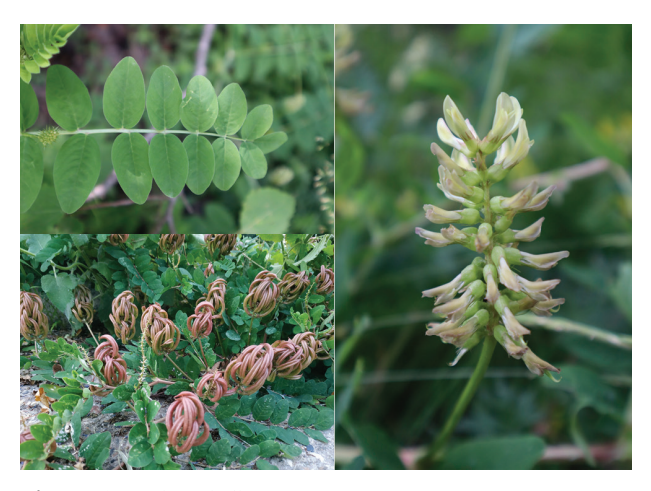
Figure 1. A. glycyphyllos.

the ethnopharmacological data is from nations living in North-eastern and South-eastern Europe. In the Caucasian region, the leaves and the seeds are used in cases of urolithiasis, oliguria, scrofulosis, dermatitis, and as a laxative. In Belarus, a decoction from the aerial parts is ingested to treat leucorrhoea, uteroptosis, and gastrointestinal disorders (dysentery). The decoction is applied topically against fungal infections of the scalp. A similar aqueous preparation is used in Ukraine as a laxative, diuretic, and mucoactive agent; against sexually transmitted infections, rheumatism, and dermatitis. Along the Volga River, the plant is used to treat diseases of the central nervous system. People from the Carpathian region also apply a decoction as a diuretic, as an expectorant, against rheumatism (arthralgia), diarrhoea, dermatitis, and syphilis; in gynaecology the preparation is given to stimulate labour and to accelerate placenta separation (third phase). This information led to clinical trials of a 10% infusion of A. glycyphyllos in Russia, which showed that it had hypotensive, anticoagulant, and diuretic activity (Lysiuk and Darmohray 2016). In Bulgaria, the species has been widely used in folk medicine as an antihypertensive, diuretic, and anti-inflammatory. The herb can be administered as an infusion in cases of cardiac insufficiency, renal inflammation, calculosis, increased blood pressure, tachycardia, etc. (Krasteva 2023).